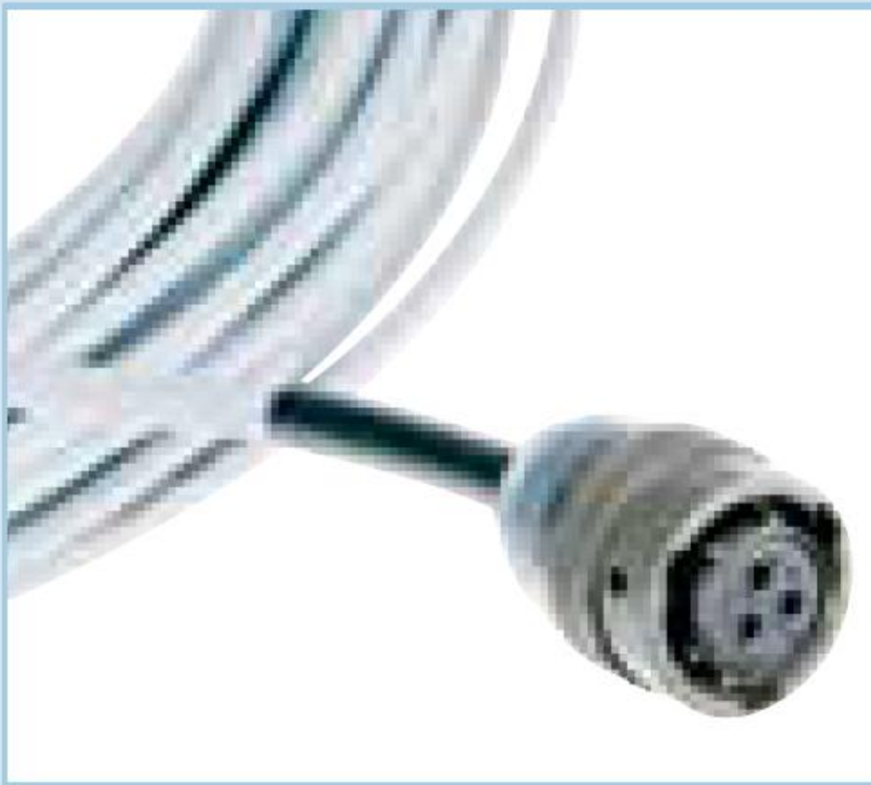
Power Cable 2,3 9291011-9-XYZ (for AE615-UDK-H)