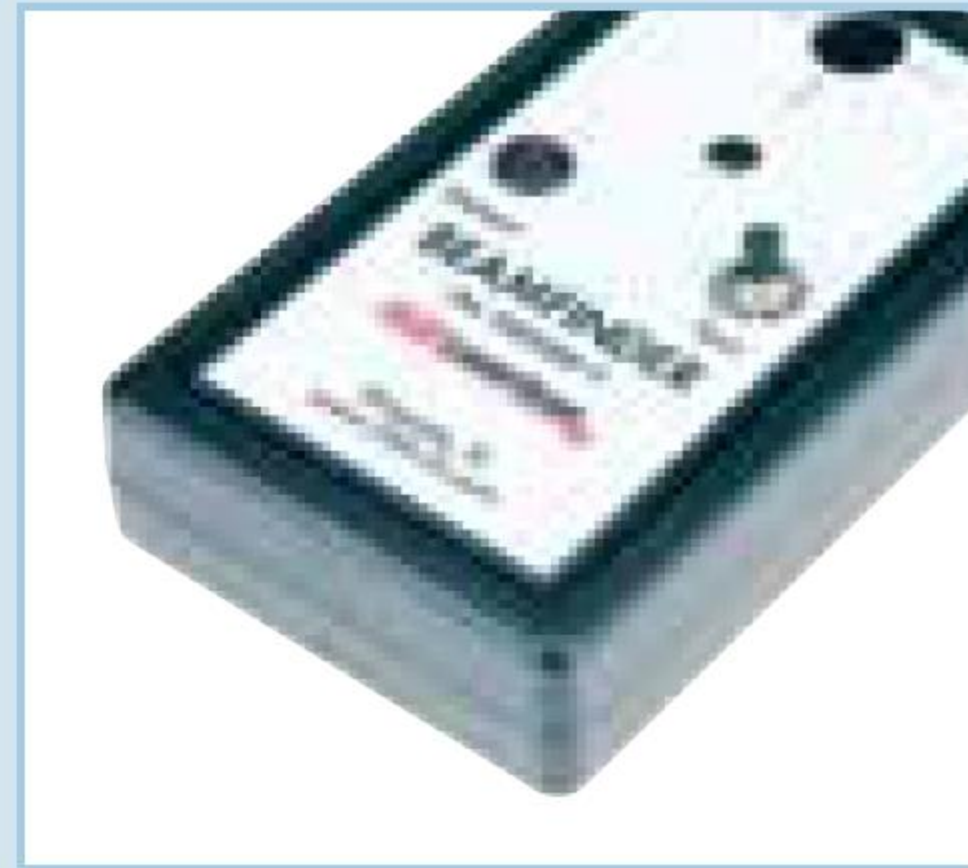
Beam Finder 9301000-9