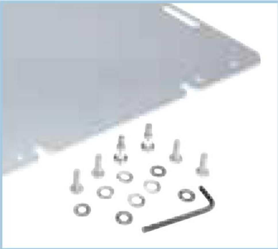
Mounting Kit 1 19471022-9