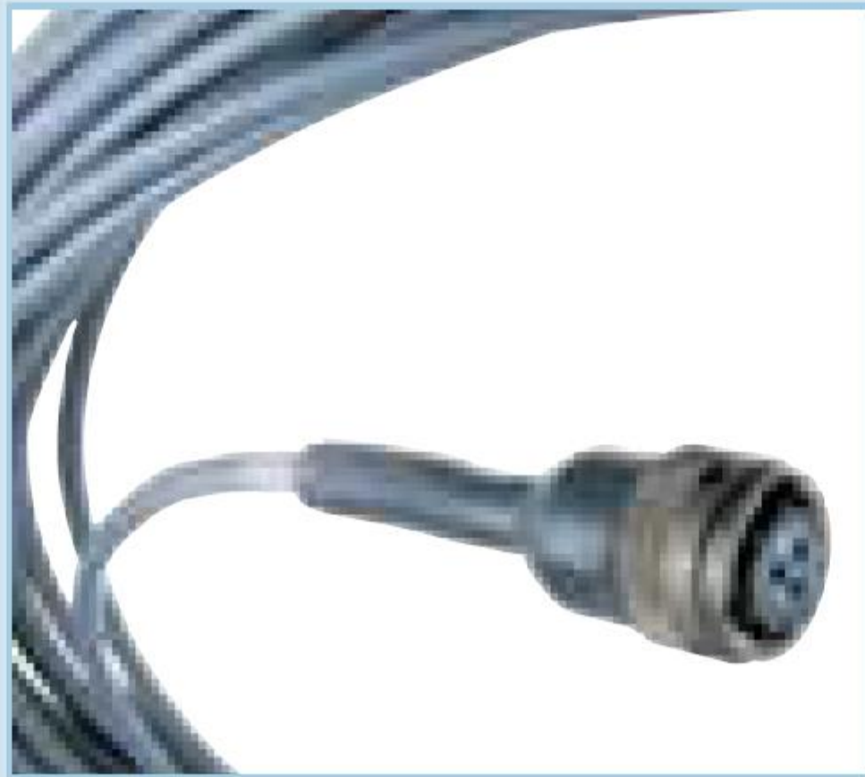
Power Cable 2,4 9291111-9-XYZ (for AE615-EDK-H)